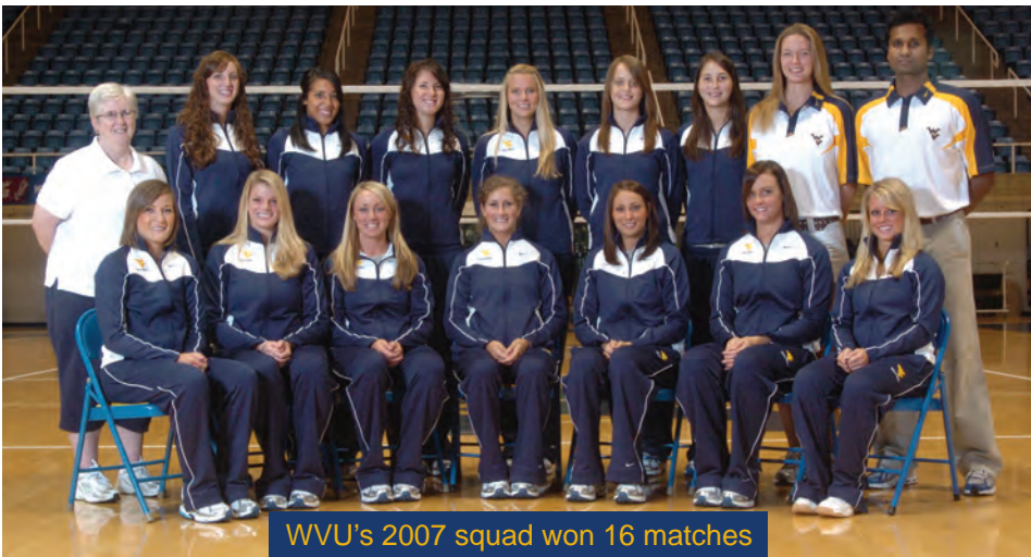
WVU's 2007 squad won 16 matches