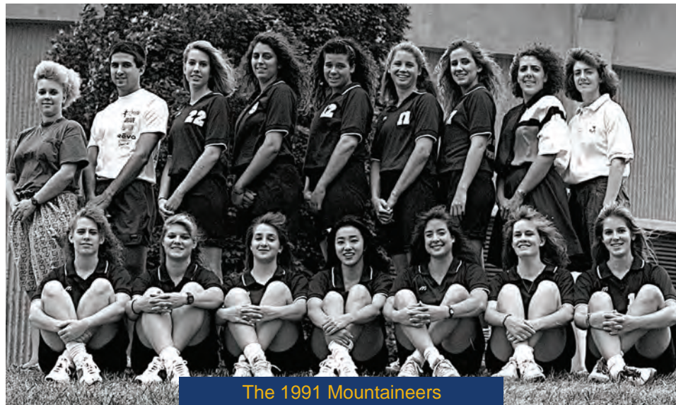
The 1991 Mountaineers